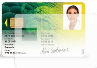
Layout for contact smart cards